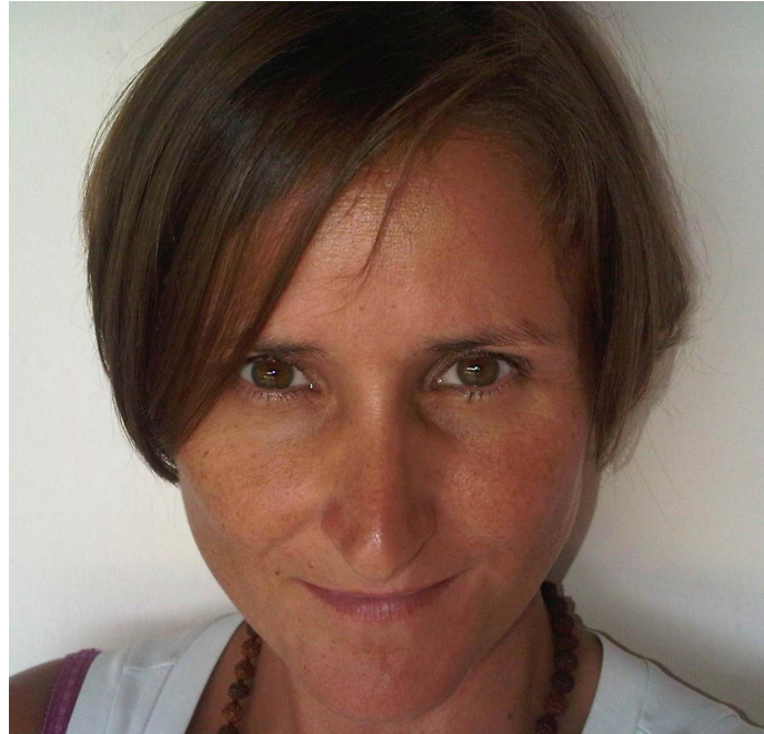
(My post Pure TDA facial glowing skin, loving it)