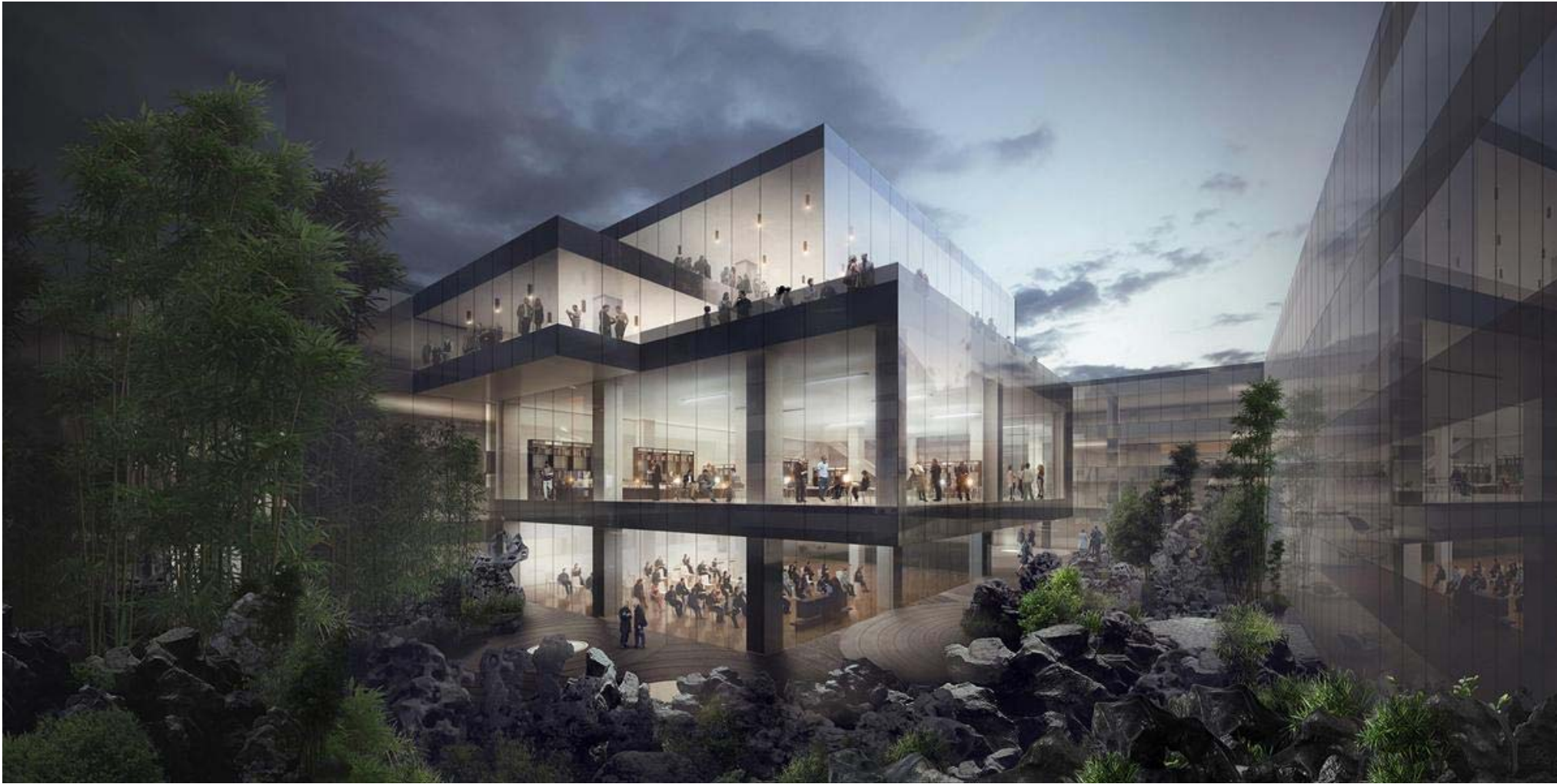
Expected to open in Q1 2017, the 120-bedroom hotel is called Puxuan Beijing Hotel & Spa Büro Ole Scheeren

Hong Kong-based design firm Remedios Studio is working in collaboration with wellness hospitality and spa design firm A.W. Lake on a new spa to be located in the Guardian Art Centre Beijing, China – the project that has been masterplanned by Büro Ole Scheeren.