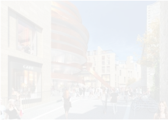
Jestico + Whiles given green light for controversial 'ribbon hotel' in Edinburgh, UK