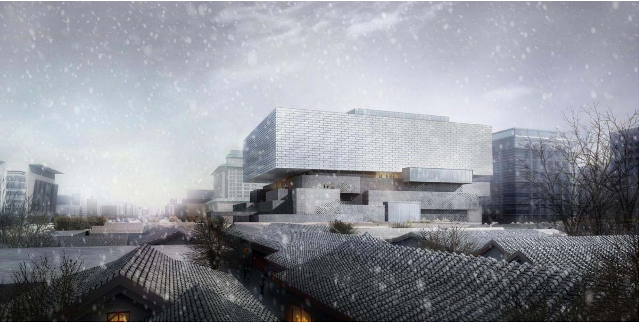
Minutes away from Beijing's main commercial and shopping district, the hotel will house two restaurants