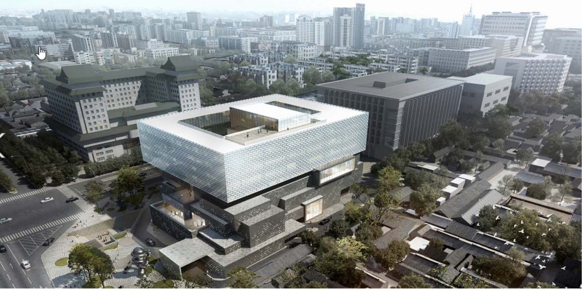
Other facilities planned at the site include a museum, courtyard, event space and several restaurants