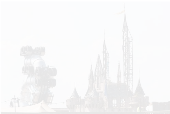
Guerilla artist Banksy secretly creates twisted version of Disney theme park