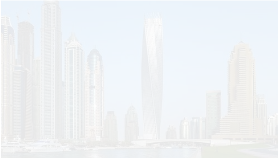
Raison d'Etre teams with M+N architecture and Blue Camel Design to create first LivNordic spa in the UAE