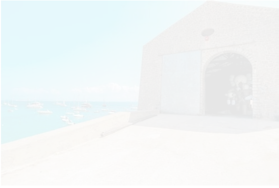
Art collector Lio Malca turns salt warehouse into contemporary gallery in Ibiza