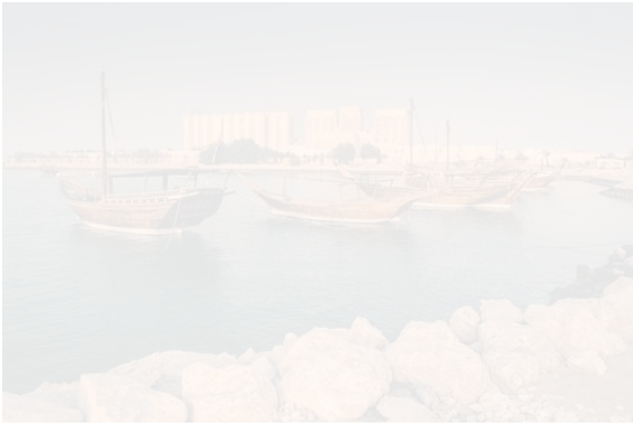
Architectural heavyweights battle it out over Doha Art Mill development