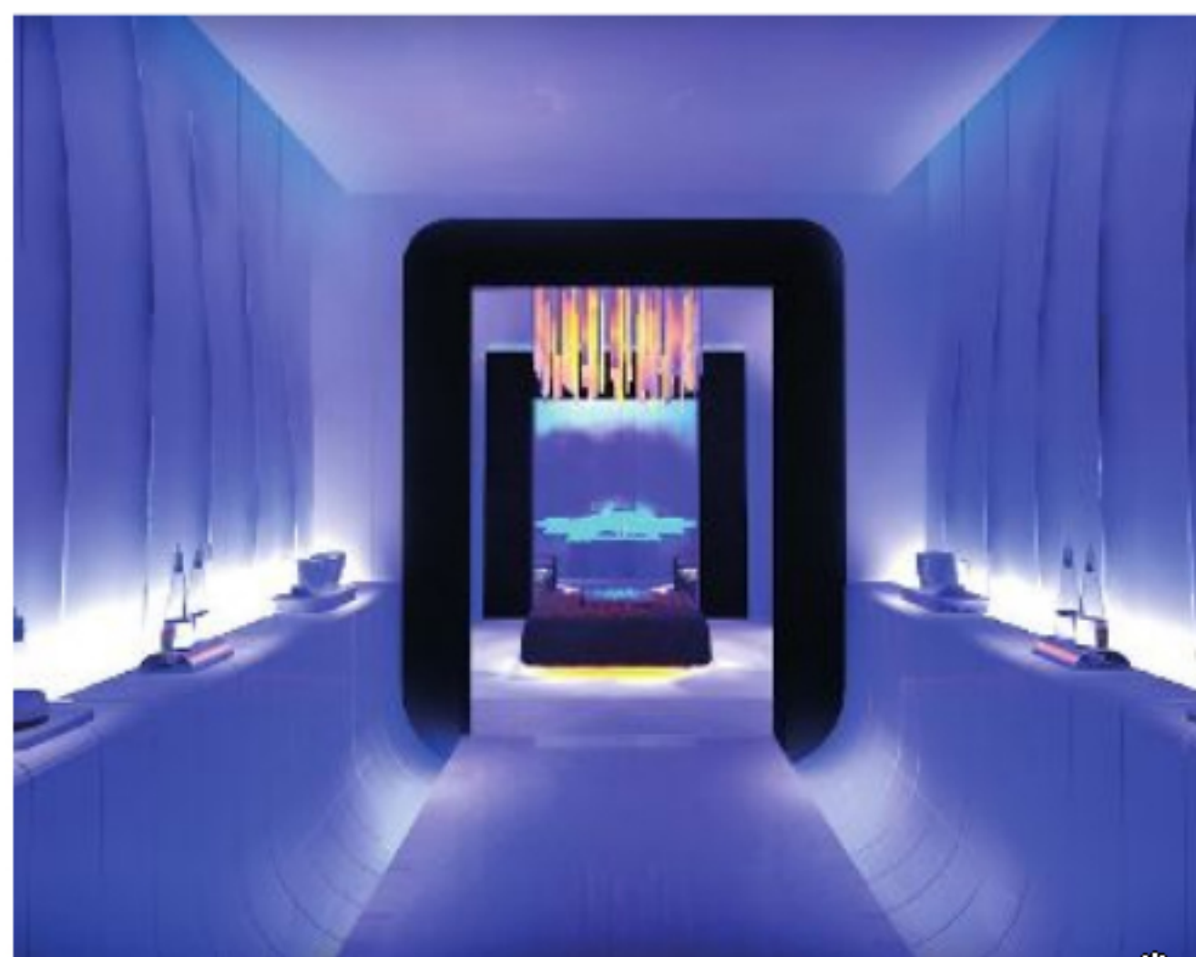
The AWAY spa has been designed by Singapore-based A. W. LAKE

The AWAY brand has been exclusively designed for the W Hotels by parent company