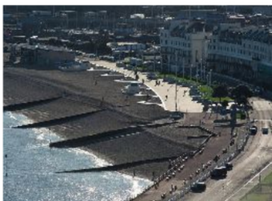
The beachfront view of the Dover Marina Hotel

Kids will also be able to produce their own lotions and choose their favourite scents for a perfume – from vanilla, chocolate, strawberry and papaya.